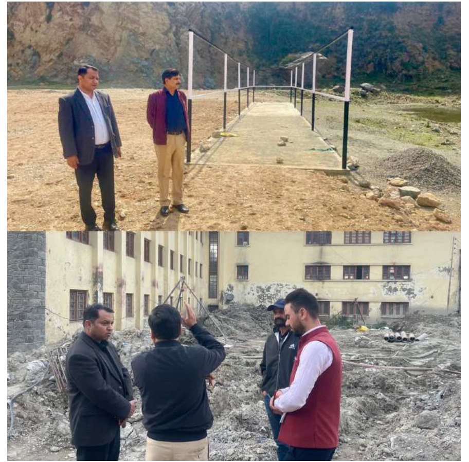
sports infrastructure being developed would provide a lot of opportunities to the young blood to hone their skills and sports talent in the most professional manner.