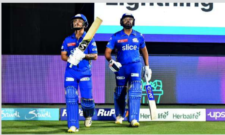
and Surya failing to fire.

Mumbai Indians batting coach Kieron Pollard admitted that things did not work out for them in their first match but said it was not about key Indian batters like Rohit, Ishan